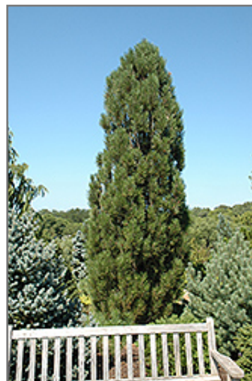
Arnold Sentinel Austrian Pine