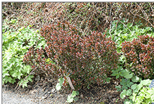
Bagatelle Japanese Barberry