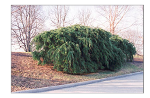
Sargent's Weeping Hemlock