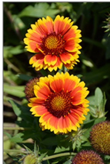
Arizona Sun Blanket Flower flowers

Arizona Sun Blanket Flower is recommended for the following landscape applications;