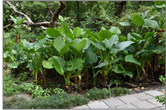
Calidora Elephant's Ear