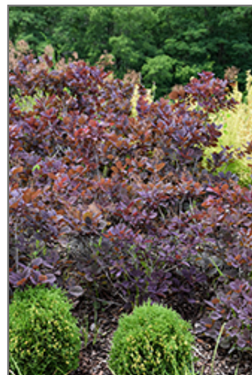
Velveteeny Purple Smokebush