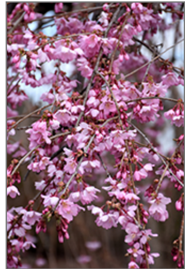
Pink Cascade Weeping Cherry flowers