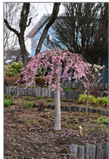
Pink Cascade Weeping Cherry in bloom