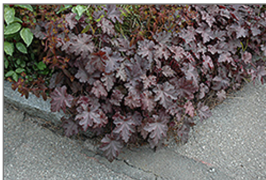
Stormy Seas Coral Bells

Stormy Seas Coral Bells is recommended for the following landscape applications;