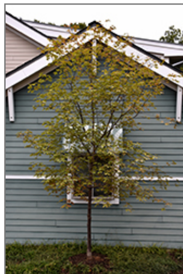
Cinnamon Girl Paperbark Maple in fall