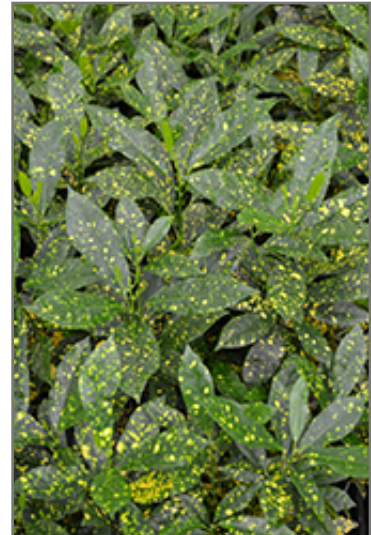
Gold Dust Variegated Croton foliage