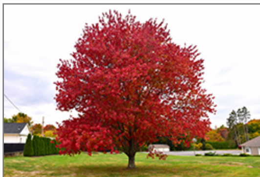
Red Maple in fall