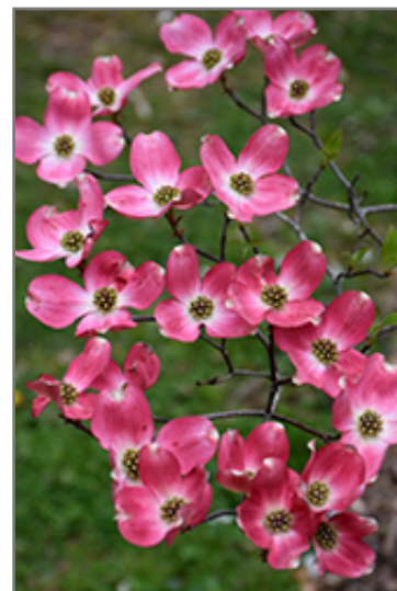
Red Flowering Dogwood flowers

Red Flowering Dogwood is recommended for the following landscape applications;