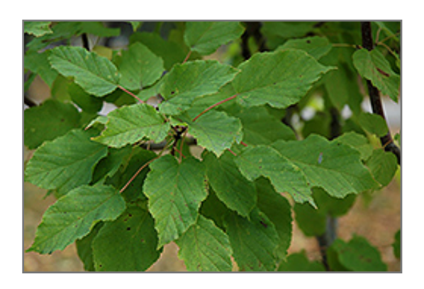
Pattern Perfect Tatarian Maple foliage

Pattern Perfect Tatarian Maple is recommended for the following landscape applications;