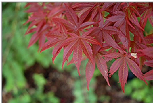
Pixie Japanese Maple foliage