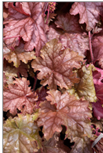
Carnival Peach Parfait Coral Bells foliage

Carnival Peach Parfait Coral Bells is recommended for the following landscape applications;