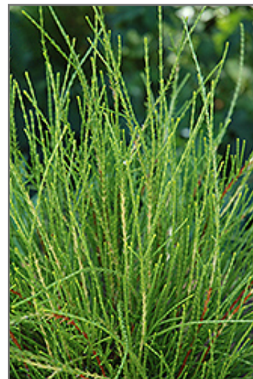
Franky Boy Arborvitae foliage