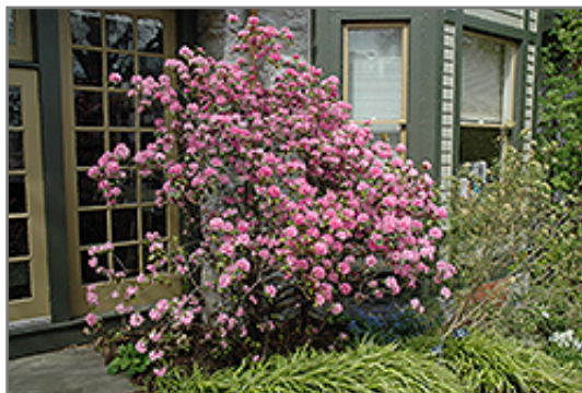
Olga Mezitt Rhododendron in bloom