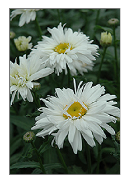
Razzle Dazzle Shasta Daisy flowers