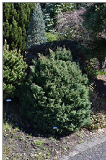
Blue Feathers Hinoki Falsecypress