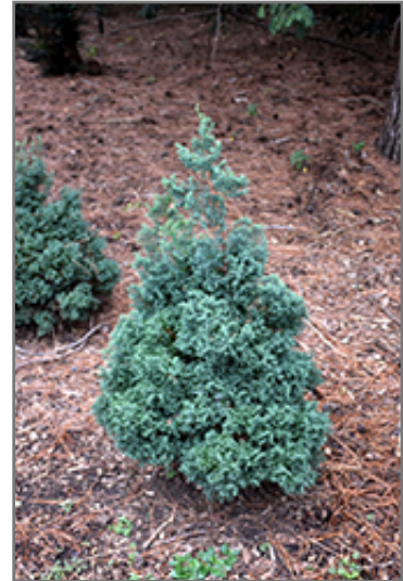
Blue Feathers Hinoki Falsecypress

* This is a 'special order' plant - contact store for details